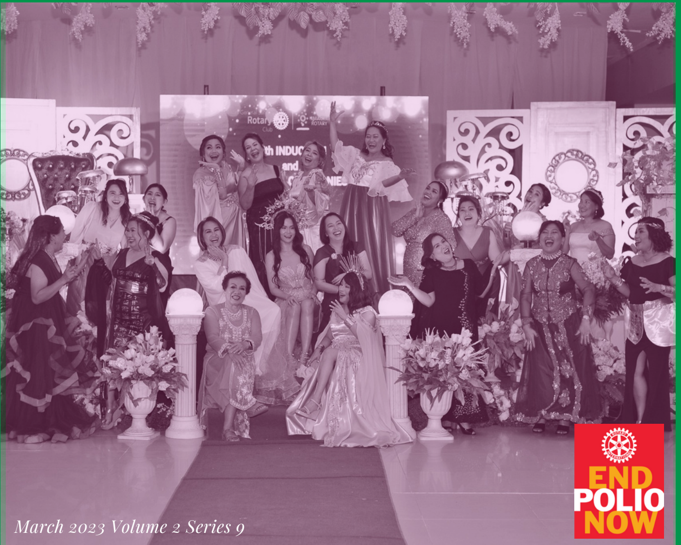
March 2023 Volume 2 Series 9